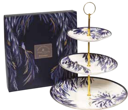
3 Tier Cake Stand, Feather Tail 27cm, 20cm, 15cm/10.5", 8", 6" SMAF78963-XG