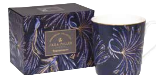
Mug, Peacock Parade 0.34L/12 fl.oz. SMAP78914-XG