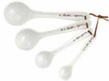
Measuring Spoons 15ml, 10ml, 5ml, 2.5ml 1tbsp, 2tsp, 1tsp, ½tsp CPW77431-XG