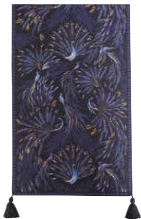
Table Runner, Peacock Parade 250cm x 35cm/98.5" x 13.8" SMA9108-XW