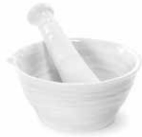
Pestle & Mortar pestle 13.5cm x 3.7cm/5.3" x 1.4" mortar 13.3cm x 6.6cm/5.2" x 2.6" CPW76825-X