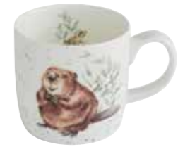
mug - the arborist 0.31L/11fl.oz MMVI5629-XT