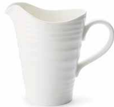
Medium Pitcher 0.85L/1.5pt CPW76817-X