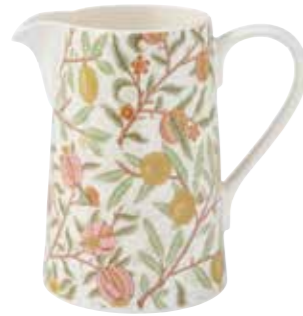
Jug Fruit 1.7L/3pt MCOT72500