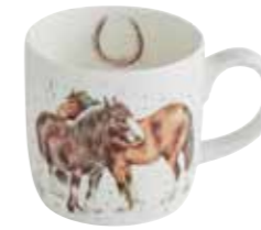
mug - side by side 0.31L/11fl.oz MMVJ5629-XT