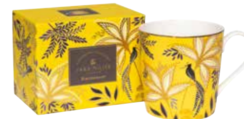
Mug, Birds & Bloom 0.34L/12 fl.oz. SMAB78914-XG