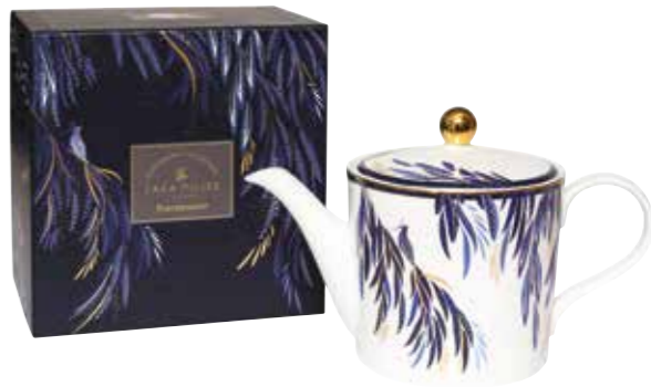
Teapot, Feather Tail 1.1L/2pt SMAF78923-XG