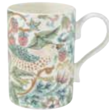
Mug Strawberry Thief 0.34L/12fl.oz MCOR48506