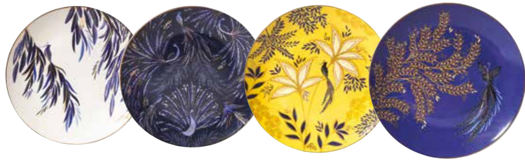
Cake Plates - Set of 4, Assorted 20cm/8" SMA78964-XG