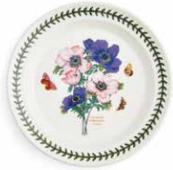
Plate Anemone 25cm/10" BGJZ05052