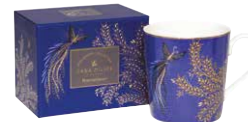
Mug, Butterfly Trails 0.34L/12 fl.oz. SMAT78914-XG