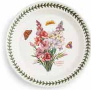
Plate Gladiolus 20cm/8" BGLO05072