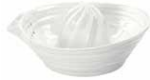
Juicer 18cm x 16cm/7" x 6" CPW76826-X