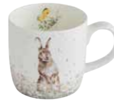
mug - fresh as a daisy 0.31L/11fl.oz MMVK5629-XT