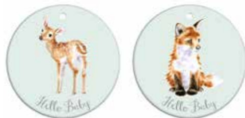
double-sided ornament - hello baby 7cm/2.75in WN4408-XG