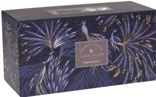
Mug & Coaster Gift Set mug 0.34L/12 fl.oz. coaster 10cm/4" SMA79525-XG