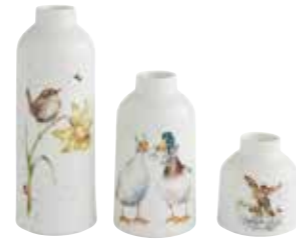
vases – set of 3 17.78cm, 12.7cm, 7.62cm 7in, 5in, 3in WN4406-XG