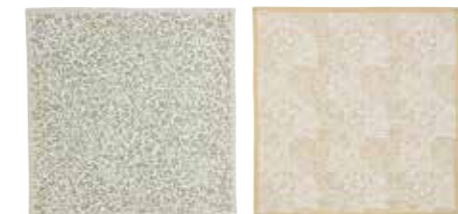
Napkins - Set of 2 Marigold & Standen 40cm x 40cm/15.7" x 15.7" MCOAC8963-XW