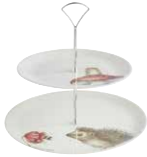
2 tiered cake stand 26.7cm & 20cm/10.5in & 7.5in WNB4375-XG