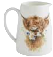
posy jug – daisy cow 8cm/3.1in WNRB4393-XL