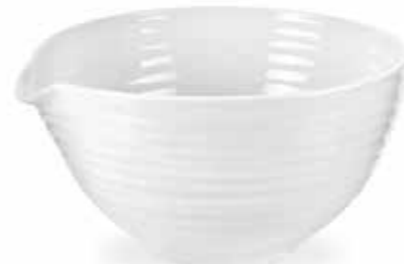
Medium Mixing Bowl 24cm x 13cm/9.5" x 5.5" CPW76528-X