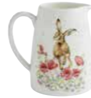
posy jug – field of flowers 8cm/3.1in WNVL4393-XL