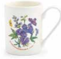
Coffee Mug Larkspur 0.28L/10fl.oz BGLQ48600