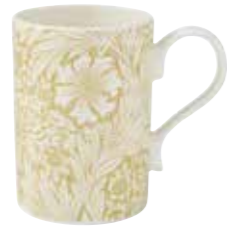
Mug Marigold 0.34L/12fl.oz MCOU48506