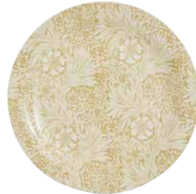
Platter Marigold 34cm/13.3" MCOU67040