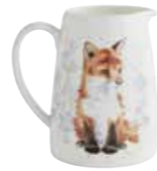
posy jug – contemplation 8cm/3.1in WNVN4393-XL