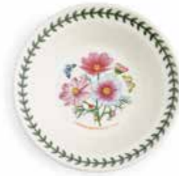
Oatmeal Bowl Cosmos 15cm/6" BGLP05202