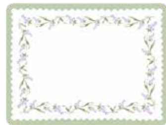
Large Placemats - Set of 4 40.1 x 29.8cm/15.7" x 11.7" X0010649259