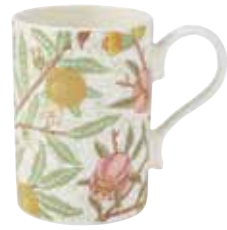
Mug Fruit 0.34L/12fl.oz MCOT48506