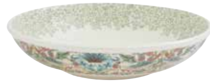
Low Bowl Standen/Strawberry Thief 33cm/13" MCOR45700