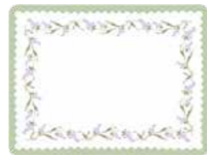
Placemats - Set of 6 30.5 x 23cm/12" x 9" X0010569259