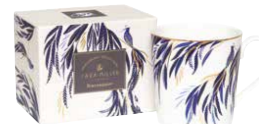
Mug, Feather Tail 0.34L/12 fl.oz. SMAF78914-XG