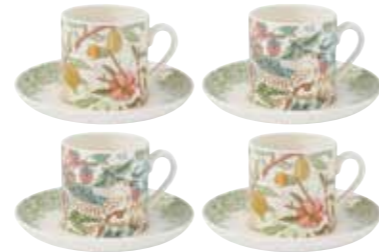
Espresso Cups & Saucers Set of 4 - Assorted 0.09L/3fl.oz MCO1200