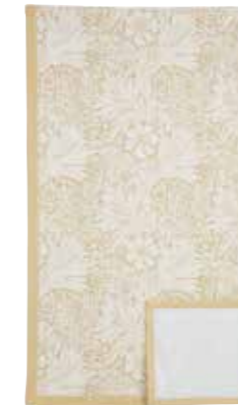
Table Runner Marigold 250cm x 35cm/98.5" x 13.8" MCOU9108-XW