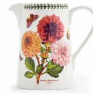
Bella Jug Dahlia 1.7L/3pt BGGA72500