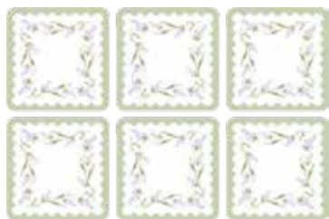
Coasters - Set of 6 10.5 x 10.5cm/4" x 4" X0010269259