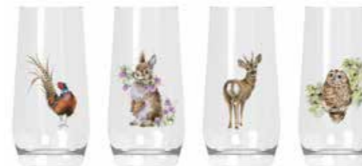
hi balls – set of 4 assorted wildlife 550ml/19fl.oz WNB4313-XG