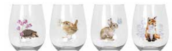
tumblers – set of 4 assorted wildlife 550ml/19fl.oz WNB4312-XG