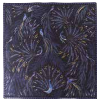
Napkins - Set of 2, Peacock Parade 40cm x 40cm/15.7" x 15.7" SMA8963-XW